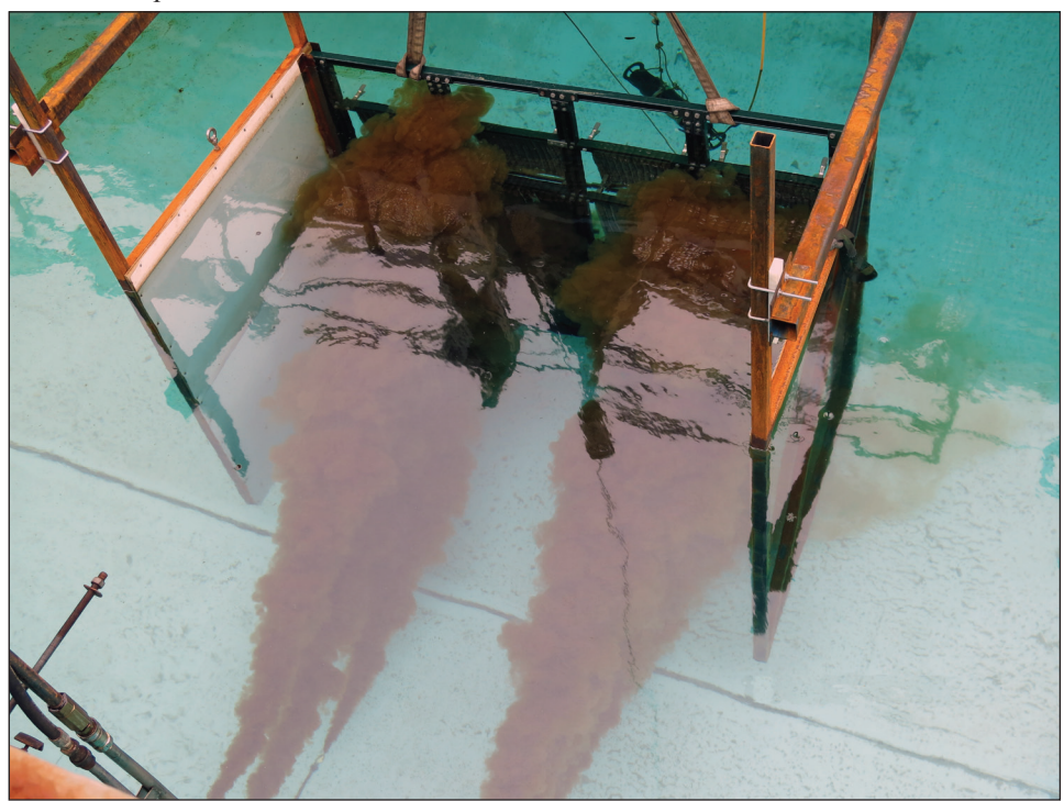
Argonne National Lab's Oleo Sponge prototype is a reusable chemically treated polyurethane foam to adsorb submerged oil. Multiple Oleo Sponge panels were attached to a metal frame and mounted to the auxiliary bridge where it encountered suspended oil plumes.