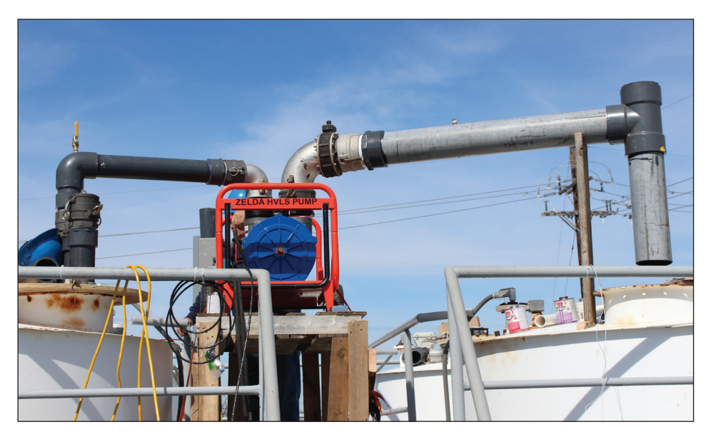
The Zelda II HVLS pump can be powered by a hydraulic motor or by a hand crank. The low operational speed reduces wear, heat and the possibility of cavitation and emulsification.

The Zelda system was powered by a hydraulic motor and was supplemented by a hydraulic power unit (HPU) on the catwalk just below the pumping system. An Ohmsett operator controlled the HPU, while the WindTrans staff operated the pump for the