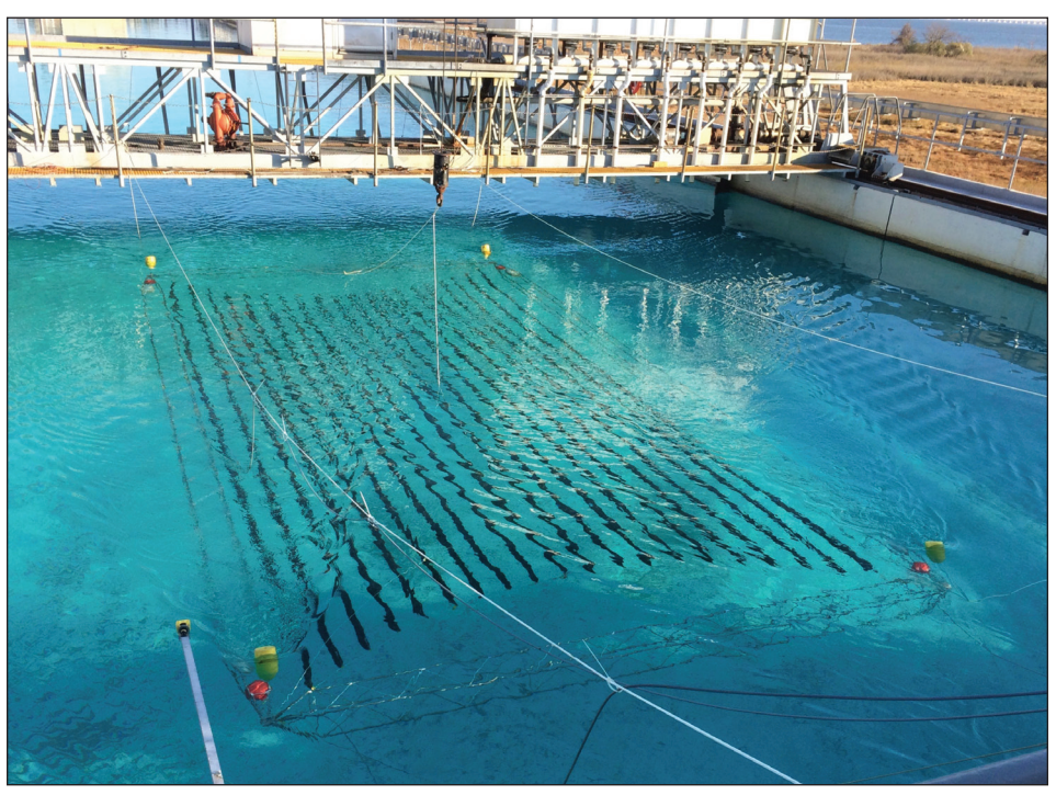
This prototype macroalgae culture system will allow kelp to grow in the open ocean to help improve the ecosystem by absorbing CO, and excess nutrients.

The opinions, findings, conclusions, or recommendations expressed in this report are those of the authors, and do not necessarily reflect the views or policies of the Bureau of Safety and Environmental Enforcement (BSEE). Mention of trade names or commercial products does not constitute endorsement or recommendation for use. This document has been technically reviewed by the BSEE according to contractual specifications.