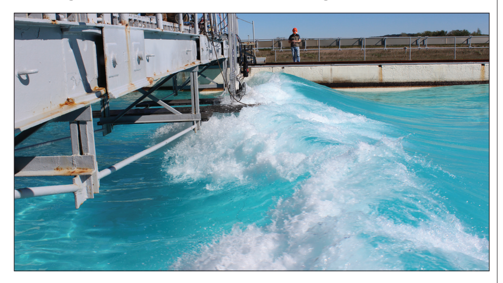
Researchers from the Applied Physics Laboratory of the University of Washington used remote sensing to detect the foam and spray of breaking waves.

The awesome power of ocean waves with frothy spray and massive swells is a stunning sight to behold, almost ethereal. They attract surfers, swimmers, and even scientific researchers from the Applied Physics Laboratory (APL) of the University of Washington. For the university researchers, their attraction is from the scientific standpoint of how that beautiful spray produced by breaking waves is detected using remote sensing. This research could also lead to an enhanced understanding of how foam and spray affect oil spill detection in the open ocean.