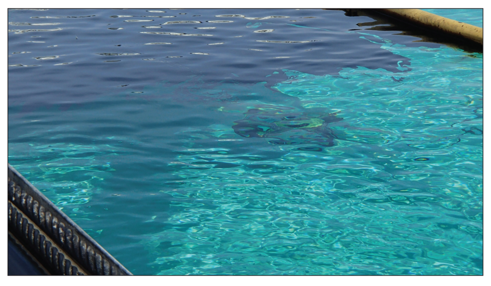
An ROV, just visible under the oil slick, is fitted with ARA's acoustic technology to collect measurements of the slick.

The project has now moved into the next step of incorporating the acoustic sensors on an ROV and an AUV glider platform.