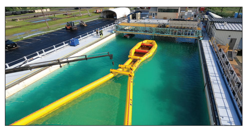
The NOFI Current Buster 4 runs through tests with three types of oil to validate and varify its ability to collect oil at 4.4 knots with and without waves.

The upgraded Current Buster 4 was tested at sea without oil under the observation of DNV, an international accredited registrar and classification society. These tests indicated the system could collect oil at a maximum speed of 4.4 knots. To verify the system is able to collect different types of oil that speed and in waves, NOFI, along with AllMaritim AS and QualiTech Environmental Inc. conducted