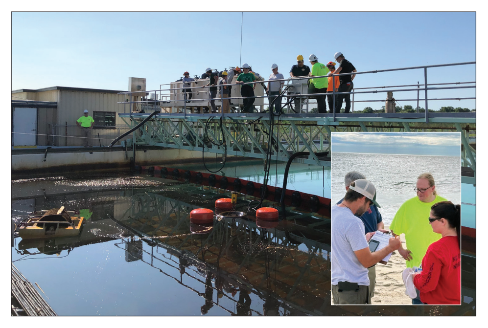
During the Texas A&M Unviersity National Spill Control School Oil Spill Strategies & Tactics training session, attendees practiced hands-on skimming operations in the Ohmsett tank, as well as SCAT training at a local beach.

The participants then went out to the Ohmsett test basin where they observed oil behavior, containment strategies, and recovery demonstrations using various skimmers. The hands-on tank exercises provided them with the opportunity to take turns operating a skimmer to collect real oil from the test basin. As a bonus, Ohmsett staff conducted a dispersant demonstration where the participants could see first-