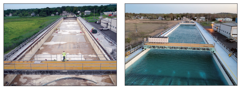
The Ohmsett tank was drained in July 2021 for scheduled maintenance. After extensive concrete repair, new seals and viewing windows, and a new epoxy coating, the tank was refilled and ready for customers in May 2022.

draining, a considerable amount of monitoring took place to make sure the in-line filter system could keep up with the high flow rate, all while maintaining the needed water quality," said Tom Coolbaugh, Ohmsett program/facility manager.